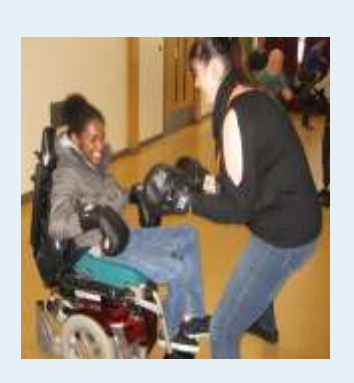
Comments from students in Year 14:

Year 14 go to Bewbush Community Centre every Tuesday. Sometimes we take the mini bus and other times we catch the 200 bus.