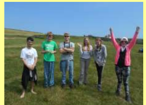
The group after learning they had passed their expedition at Kimmeridge Bay.