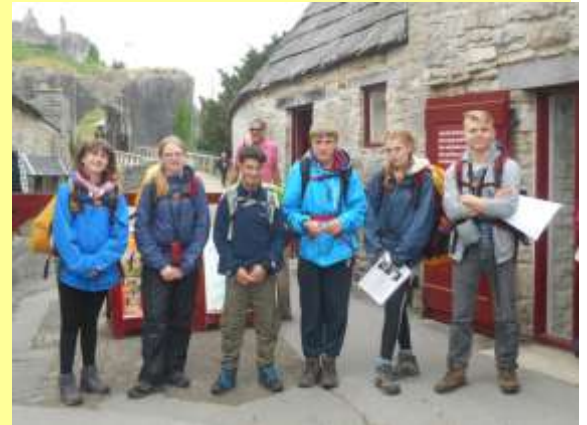
The group outside Corfe Castle