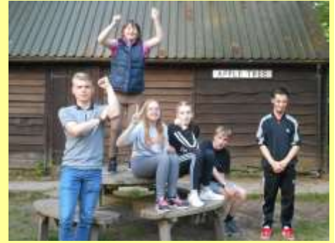
At Foxlease the night before the expedition

The route was perfect, as it was very varied and challenged them all in different ways. They had to cope with relationship difficulties, uneven ground which one student in particular finds very difficult, home sickness, very hot weather on the beach on day 1 and wet weather in the morning on day 2. It is not a group that would normally work together at school so it took a while for them all to bond. Two of the girls really didn't like each other to begin with but ended up being really good together as they found they had a lot in common. Another, on the practice expedition, really struggled with the change of routine but was really determined to make it work, and he did.