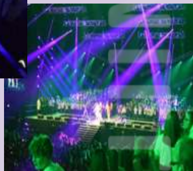
Guest star, HRVY, performing