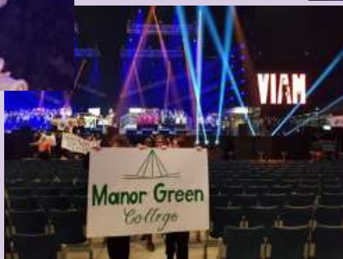
Banner Parade (Rehearsals)