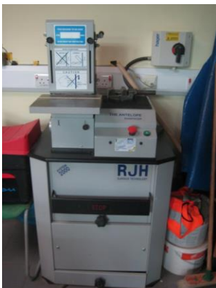
The band facer

Students have to be very careful in the DT room because of all the tools and machines.