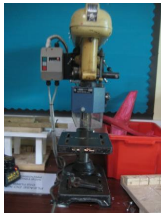
The pillar drill

When I do DT I will learn how to use the tools.